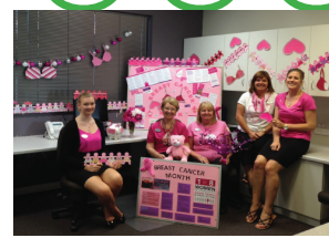
Eaton Medical Centre