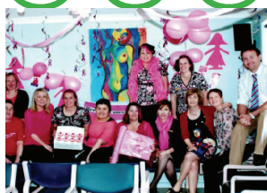
Altone Medical Centre