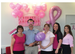
Joondalup Drive Medical Centre