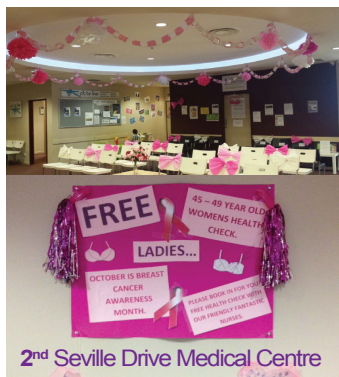
2nd Seville Drive Medical Centre