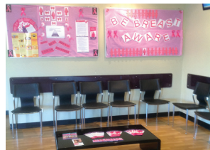
Granada Medical Practice Kelmscott