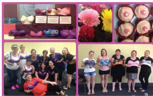
And the winner is... Women's Health and Wellbeing Services