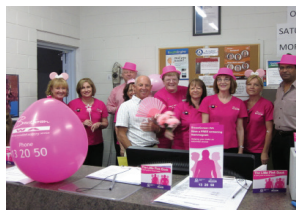
Glengarry Medical Group