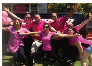
Wishing Well Clinic Australind