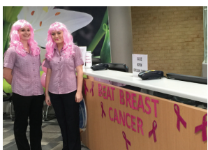
Joondalup City Medical Group