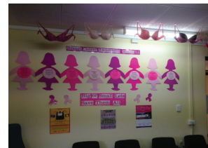
Harvey Medical Group