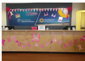
Port Kennedy General Practice