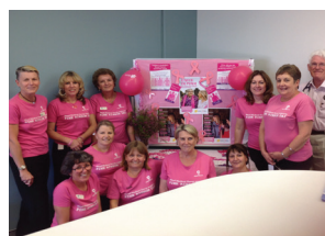
Mead Medical Group Kalamunda