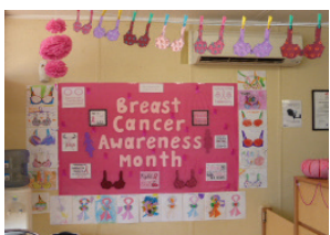
Sonic Health Plus Newman