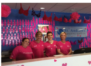
St Andrews Medical Group