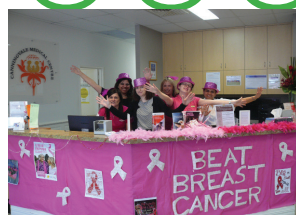
Canning Vale Medical Centre